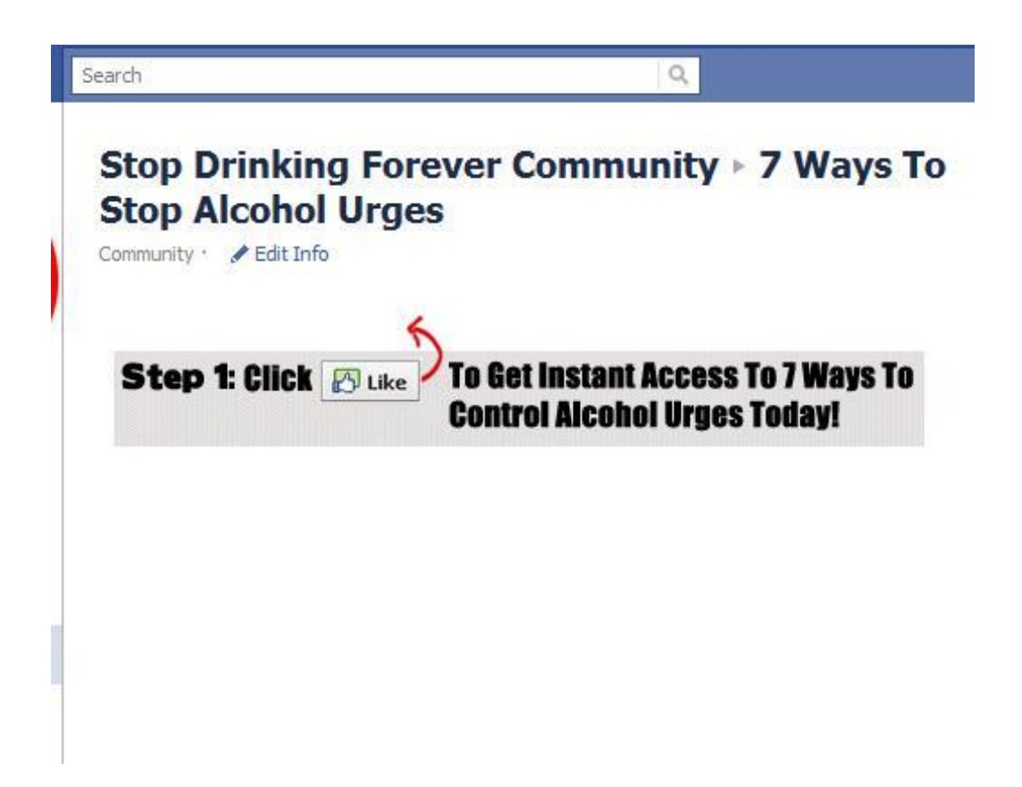
Diagram 1: A non-fan has to "like" your page to get a free gift

Diagram 2: New fan gets instant access to the free gift by entering his name and email (this is your code for the opt in box)